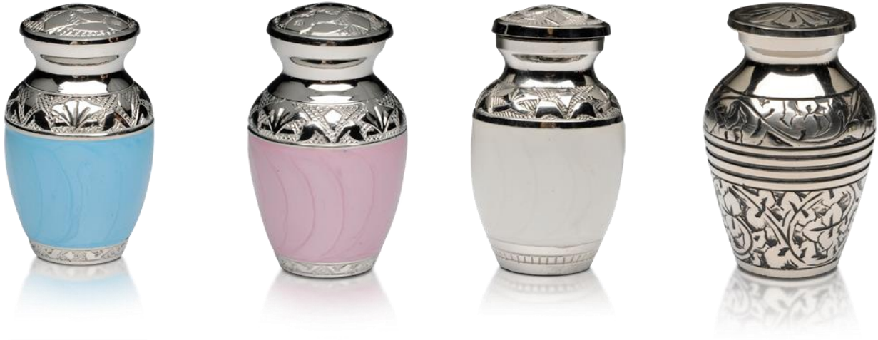
Keepsake Striped Urn - 7.5cms tall, $110